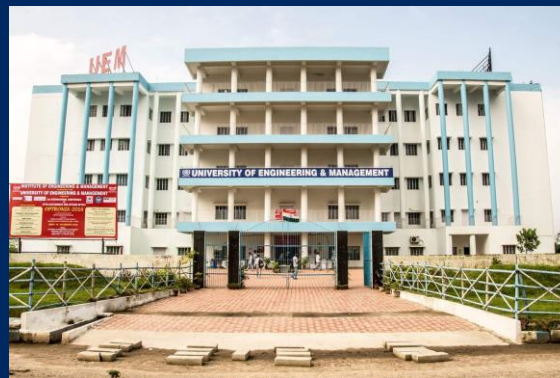
University of Engineering & Management, Kolkata