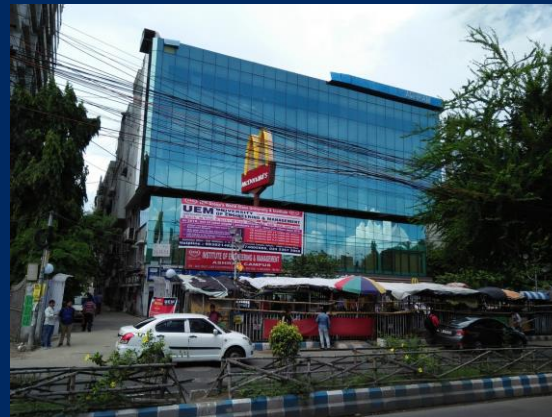
Institute of Engineering & Management Ashram Campus